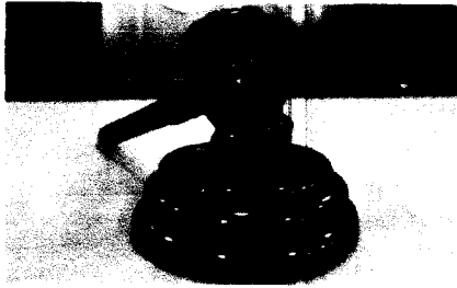
Generic Gavel File Photo