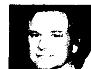
Sexy In Their 50s