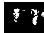
Father and Son