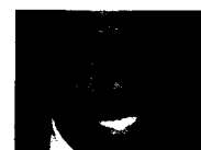
Notable Deaths 2011