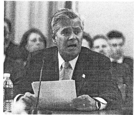
Senate Republican Leader Dean Skelos, R-Rockville Centre, testifies during a legislative hearing on open government in Albany Wednesday. Skelos says he and fellow Republicans are kept out of talks between the governor, Assembly speaker and Senate majority leader where the budget and other issues are discussed.

Let's have a little sunshine on the subject of how local communities get their City