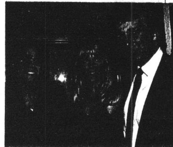
MICHAEL JACKSON, MARLA MAPLES, AND DONALD TRUMP